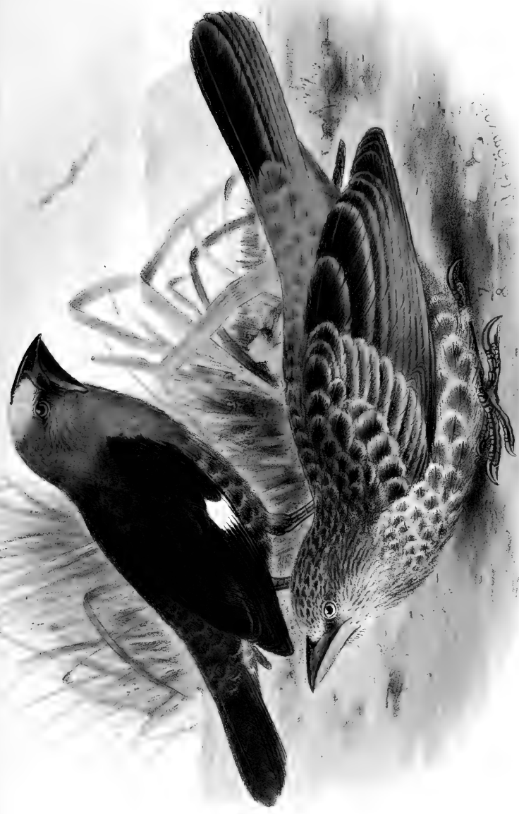
1 Amblyospiza castaneiceps 2 Heterospiza rubrifrons